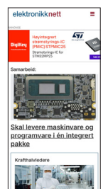
On smartphones and tablets