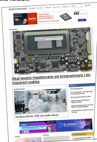
The Web – Daily news