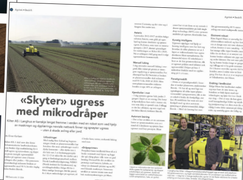
Elektronikk can also be enjoyed in a digital version